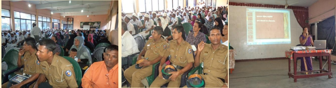
Community and Schools Programs