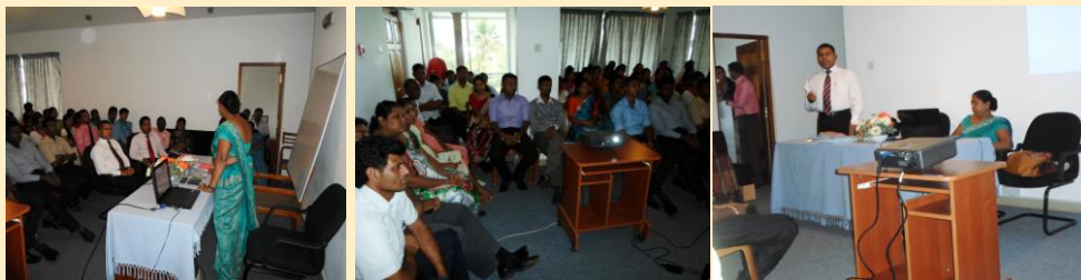
Ranaviru Appeals Program and Rakna Lanka Program, Al Hidaya